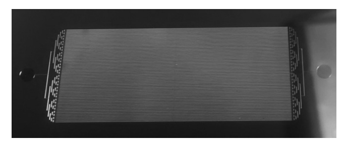
Figure 3: Etched silicon mold for hot pressing.